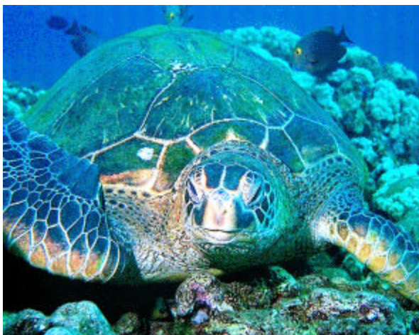
Ursula & Peter Bennet

Fibropapillomatosis is a disease that was first described in green sea turtles in Hawaii in the 1930s. Today it affects around 50% of the green turtles in Hawaii and is also found at high levels in other green turtle populations, such as Florida. FP causes tumors to grow on the eyes, mouth, neck or flippers. These tumors are not deadly until they begin to block the sight, breathing, or feeding activities of the turtle. The cause of FP is still unknown, but it appears to occur more commonly in areas that are highly impacted by human activities.